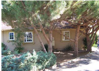
Top: Bayfair Home; bottom: Fairview Home