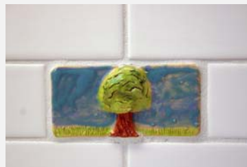
Details from Creative Growth mosaic installation at Magnolia Terrace