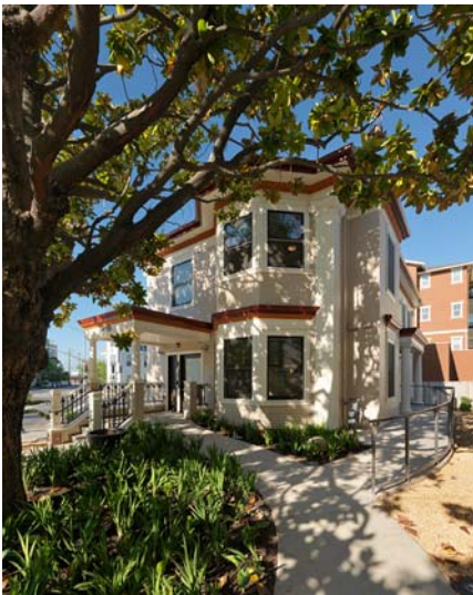
Newly renovated Magnolia Terrace

Magnolia Terrace opened on a beautiful Monday in May 2011. HCEB and the development team were joined by the Mayor of Emeryville, several members of City Council, Creative Growth Art Center artists and staff, funders and supporters, and our partners and friends in the affordable housing community.